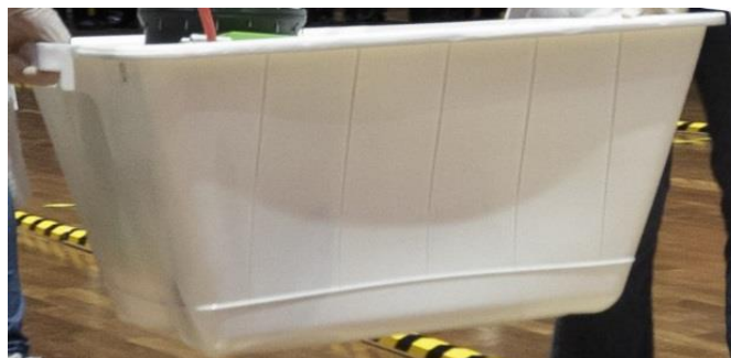
Figure 1: Transport box.