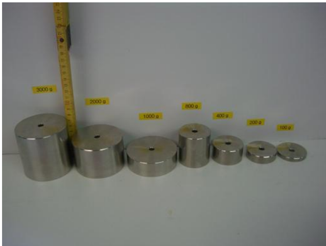
Figure 2: Used weights provided by the kjVI.