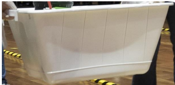
Figure 1: Transport box.