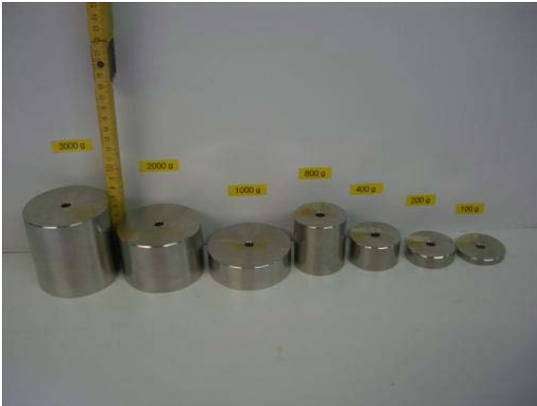
Figure 2: Used weights provided by the kjVI.