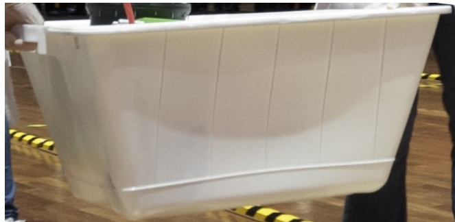
Figure 1: Transport box.